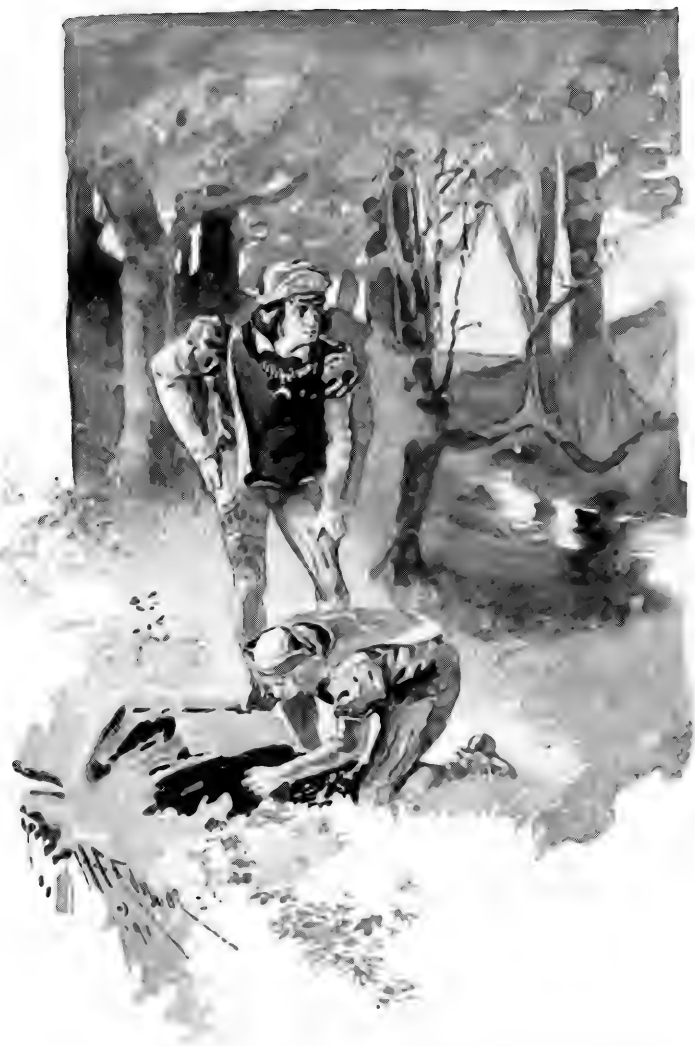
"MEANWHILE THE BROTHERS STOLE TO WHERE THE SLIPPERS LAY."—Page 27.